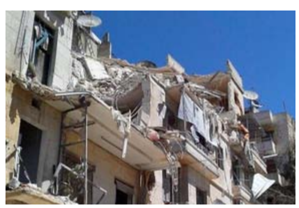
Syria update. Five years of war has left every Armenian family with barely enough to survive. We've helped 6,000 people in 2015, our doors open daily with aid and encouragement.