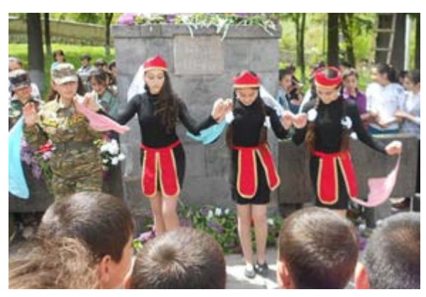
Revival on the border. A typical day in Aygehovit village begins with shooting from the Azerbaijani border, but our cultural life project has brought new life to this community.