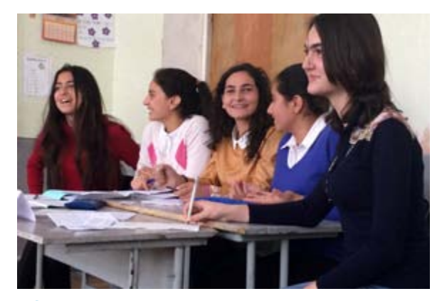
Giving catalog. Choose direct giving to specific projects closest to your heart, from sponsoring students for debate or vocational school to bringing electricity to an apartment in Aleppo.